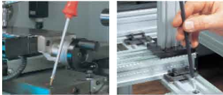
Patented holding system with retaining spring holds all TORX® or TORX PLUS® screws* securely in place.

The highlight of Wiha's MagicSpring tools is the stainless steel "magical" retaining spring that, together with a thin cover disc, is laser-welded to the tip of the blade. This innovation acts as a clamp between tool and screw, so that the latter is firmly gripped by the tip of the blade.