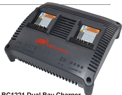
BC1221 Dual Bay Charger

The USB charge port on the side means you don't have to fight for an outlet with your tablet or smart phone. Let us take care of the clutter; you take care of what's next.