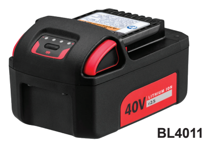
IQV40<sup>™</sup> Lithium Ion Battery Pack 40V, 2.5 Ahr